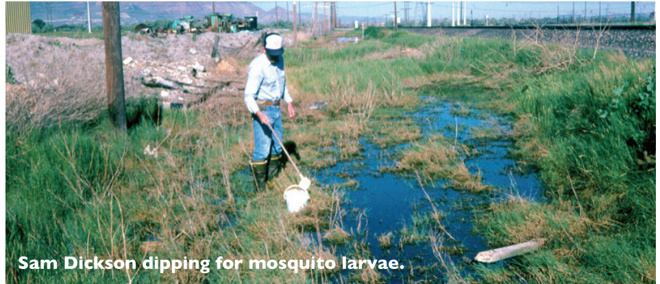
Sam Dickson dipping for mosquito larvae.

Mosquito abatement districts also test thousands of captured mosquitoes for a number of diseases including