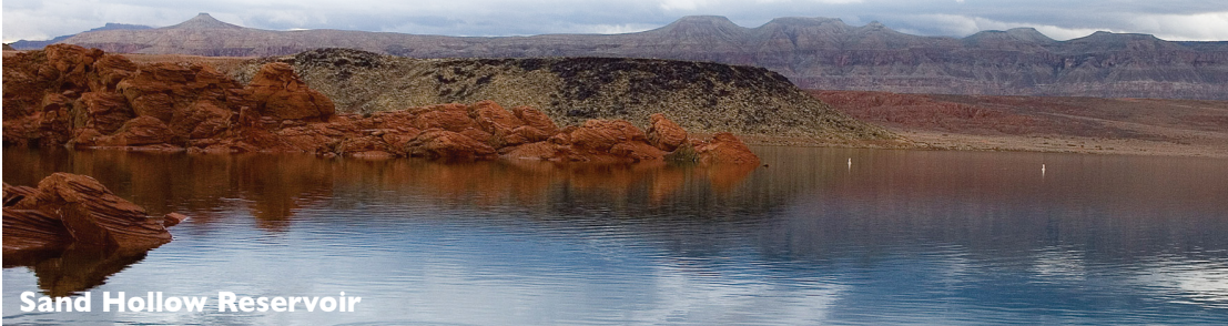
Sand Hollow Reservoir

Thank you for an experience I will cherish for years to come. I consider all of you my friends.